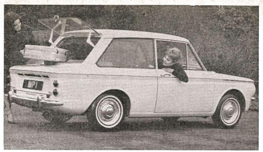
The Imp well fulfils the promise of its design brilliance