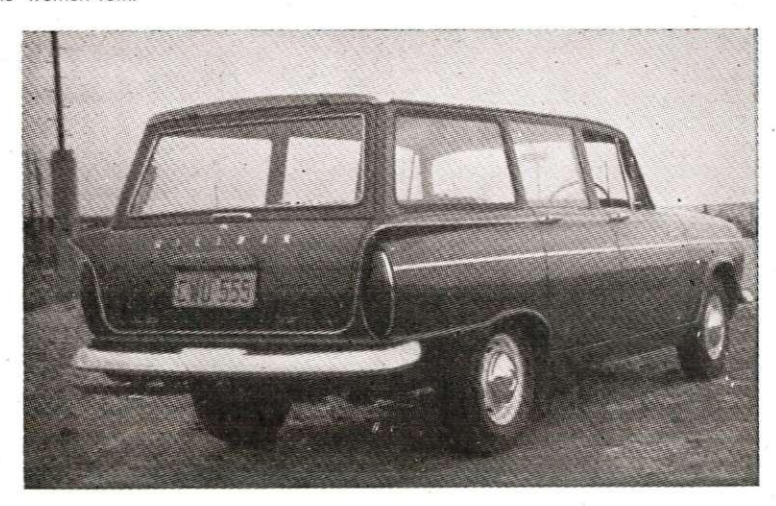
The Super Minx Wagon — a car of many roles.

Top-gear pulling power is good throughout a wide speed range and it is this broad top gear performance that will endear it to the average family motorist and certainly to the women-folk.