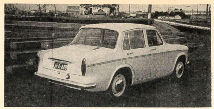
The Hillman deluxe, a family car.

The gearbox performs its functions well, the ratios are appropriately spaced and the synchromesh most effective.