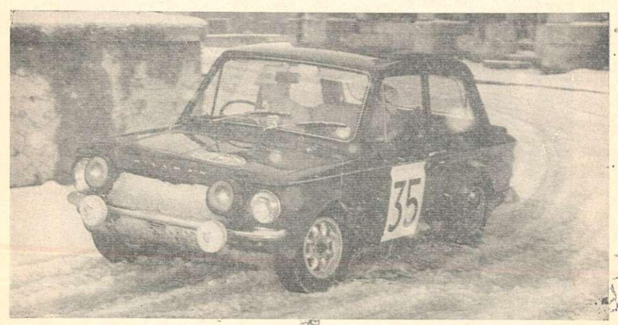
The Tulip Rally winning Hillman Imp driven by Rosemary Smith and "Tiny Lewis" motors on through heavy snow. Note alloy wheels.

Its handling was outstanding for a rear-engined car. In normal running the car understeers slightly; this changes to oversteer as cornering speed goes up. Even though the driver is always aware of the weight behind him, the Imp inherently is incredibly safe. Neutral cornering can be induced by altering tyre pressures, though the ride is generally comfortable and stable.